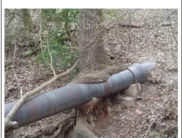
Image 1: There is little to no lateral movement that can be observed in this pipe even though there is no support from soil on the other side of the tree.

When it comes to a root moving a pipe laterally, this may at first instance seem more likely.