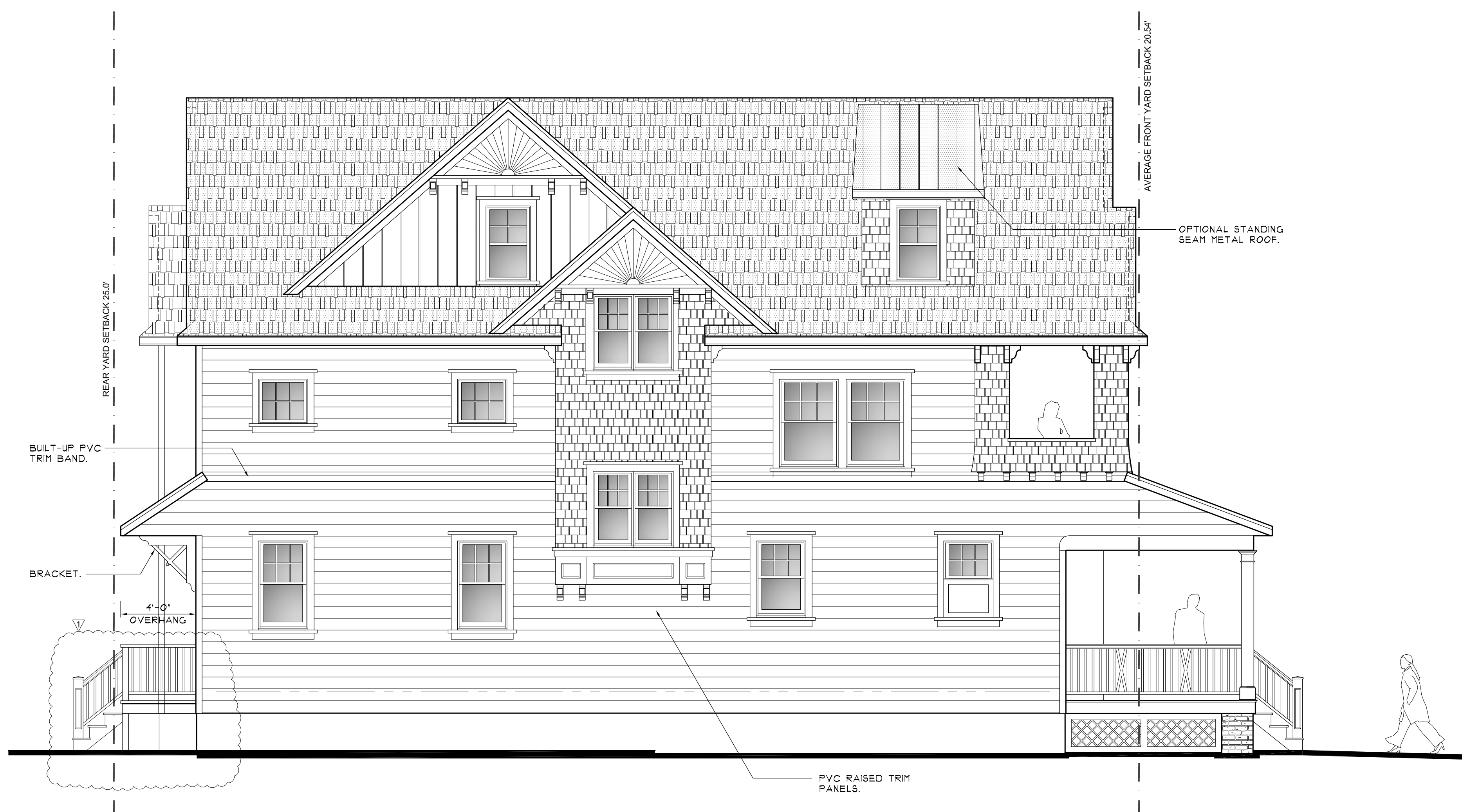
2 PROPOSED LEFT SIDE ELEVATION SCALE: 1/4" = 1'-0"

JOB NUMBER 19280 DATE: 06/16/2020 SHEET NUMBER 1 OF 3 A-1