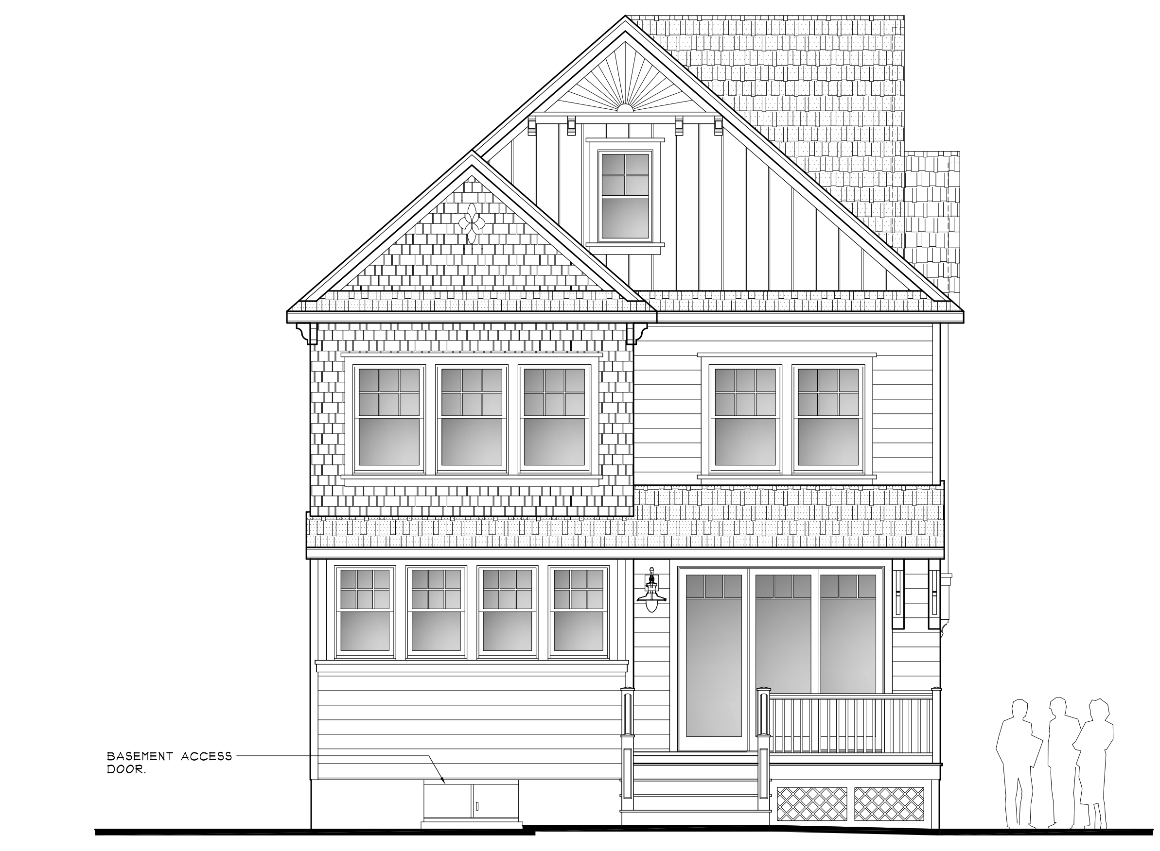
4 PROPOSED REAR ELEVATION SCALE: 1/4" = 1'-0"