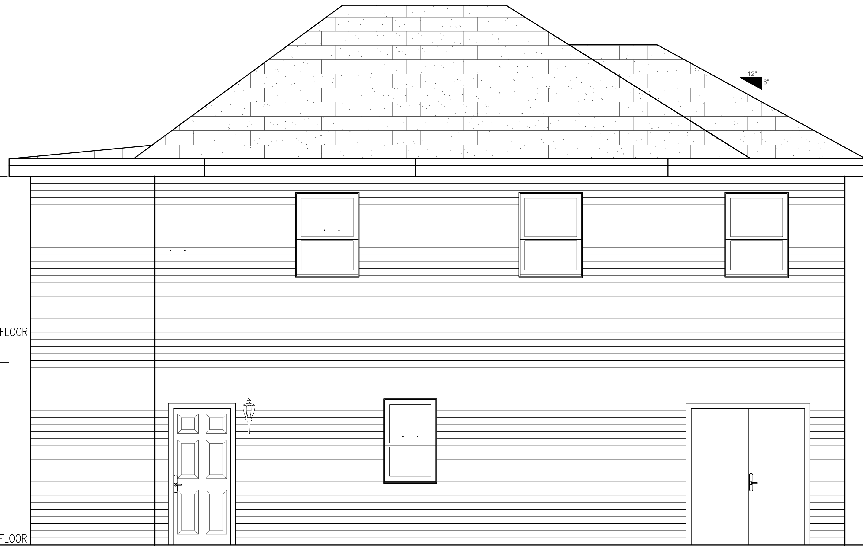
3 LEFT ELEVATION SCALE: 3/8"=1'-0"