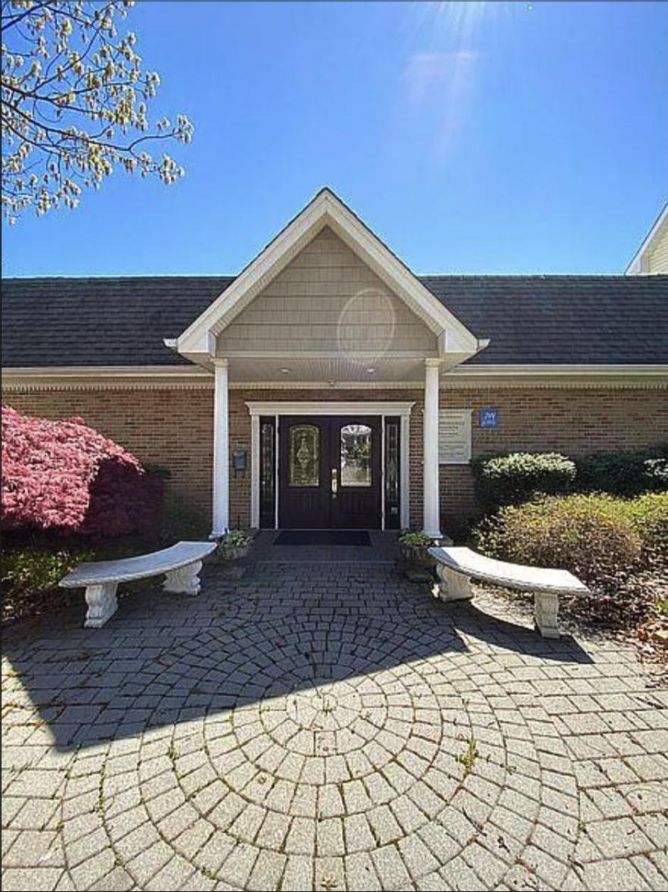
1 PHOTO OF EXSITNG FRONT FACADE