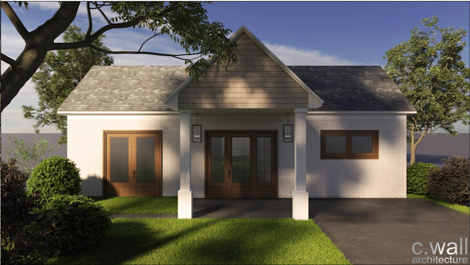
2 RENDERING OF PROPOSED FRONT FACADE